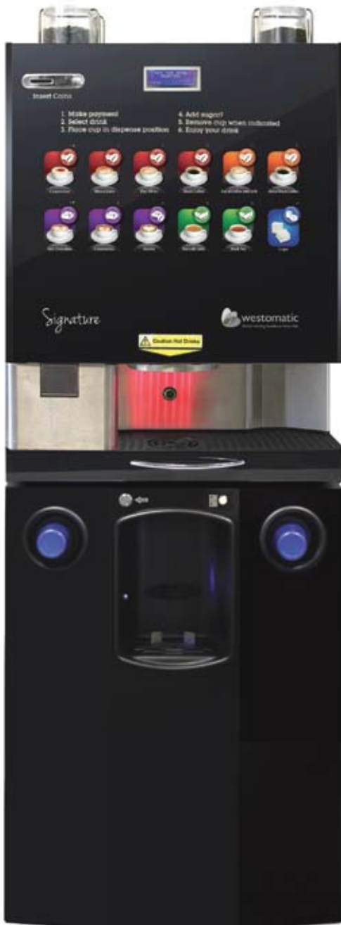
*Shown with a H2O lockable base cabinet