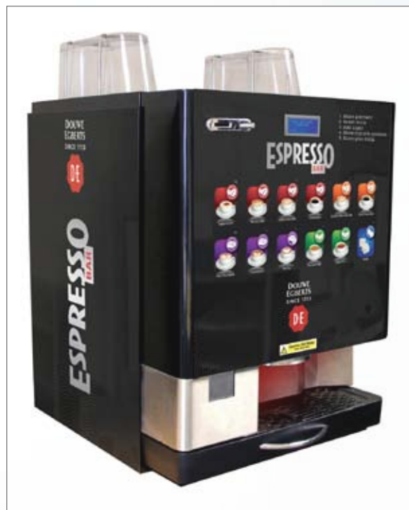
*Shown with Douwe Egberts branding

Its stylish good looks, exceptional drink quality and illuminated touch button system make the Signature the perfect tabletop for modern style-conscious locations.