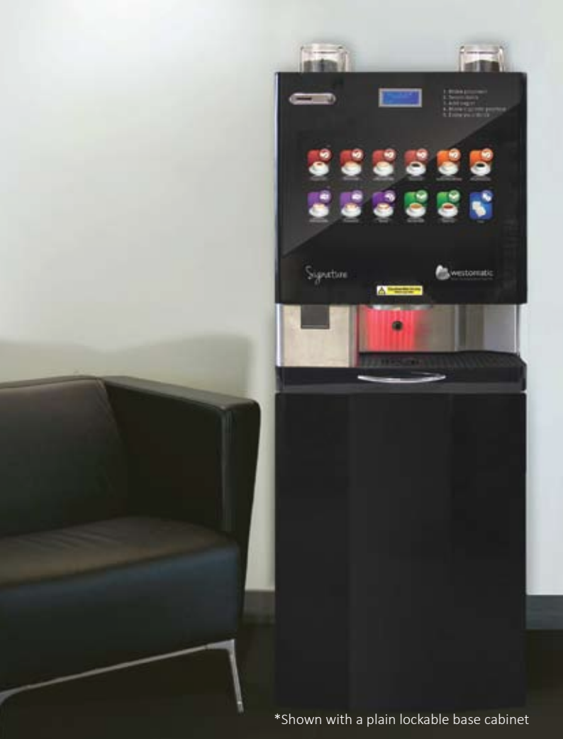
*Shown with a plain lockable base cabinet